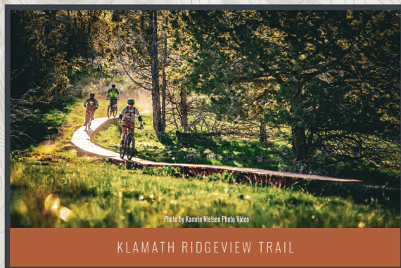
KLAMATH RIDGEVIEW TRAIL