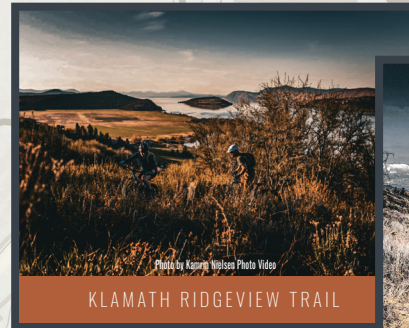
KLAMATH RIDGEVIEW TRAIL