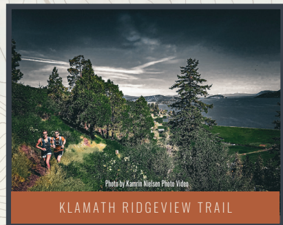
KLAMATH RIDGEVIEW TRAIL